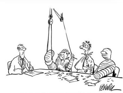
"WE BELIEVE WE NOW HAVE A CONCENSUS ON THE CAD STANDARDS"